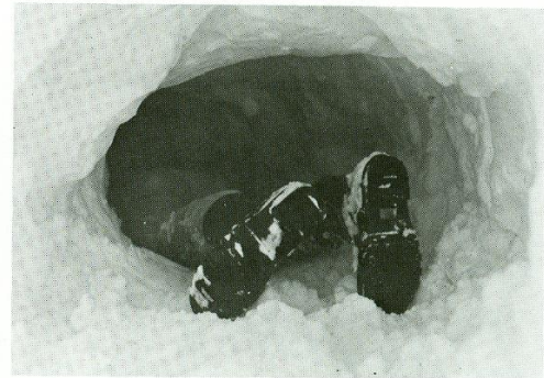
Snowed in, ambitious student attempts to tunnel out.