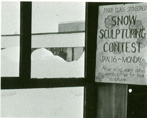
Too much snow to make a snowman.