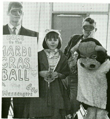
Mardi Gras promotion was done during lunch.